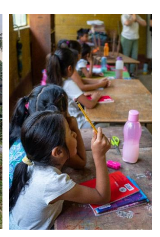
Photos of the 'Roads to Farms' project, the new Farmers' Market, and Santa María Tzejá's future generation of leaders.